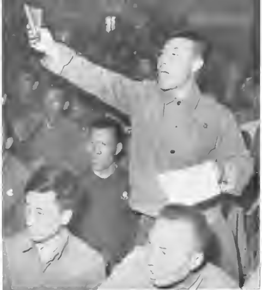
Workers repudiate scab Liu Shao-chi's counter-revolutionary revisionist line in running factories.

better and more economical results in building socialism" in production and the defence of China's security; (4) eliminating unreasonable rules and regulations, strengthening labour discipline and practising economy in production; and (5) making technical innovations on a big scale.